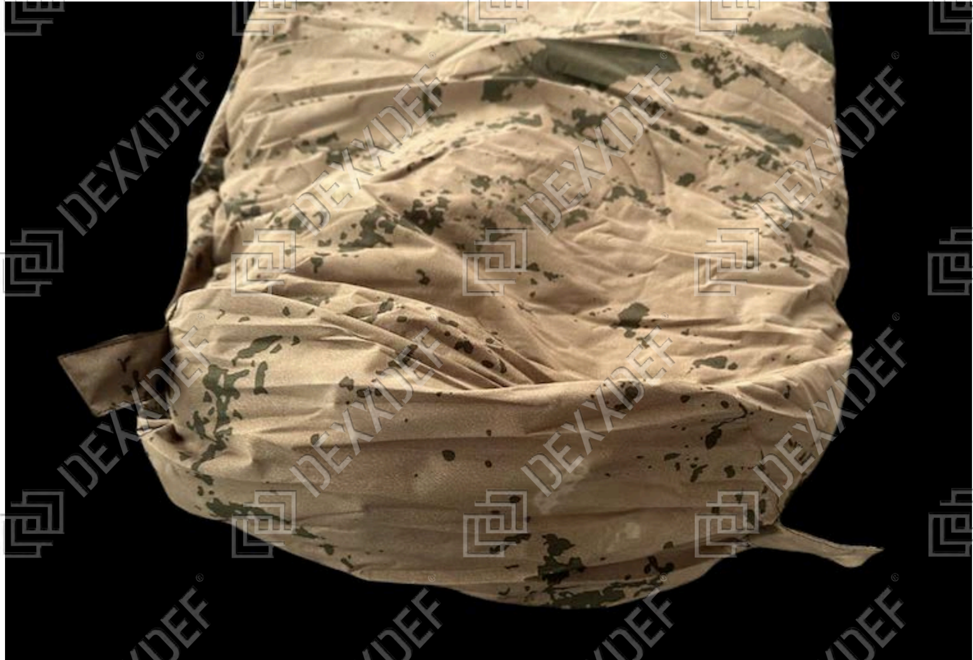
Military Sleeping Bag