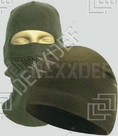
SKI MASK & BERET