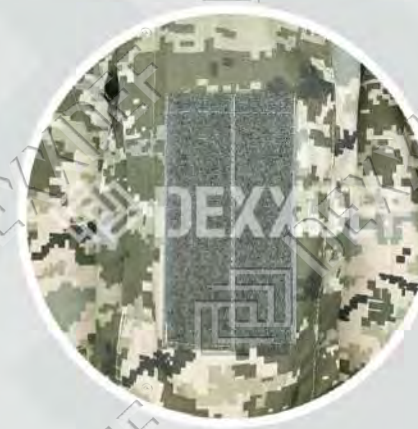
Velcro For Flag & Pen Pockets