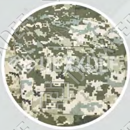
Pocket With Velcro