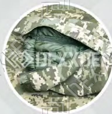
Separable Isolation Pants