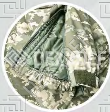
Zipper For Pants' Cuff