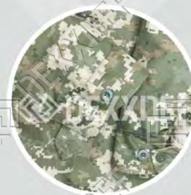
Adjustable Sleeves for Jacket