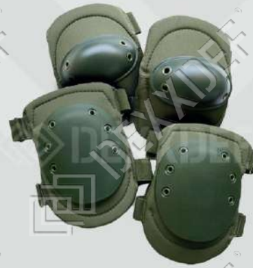
ARM AND KNEE PADS